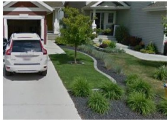
Correct – A distinct boarder containing additional shrubs has been installed between the artificial turf and neighboring sod.

Note: Landscaping plans cannot be reviewed prior to implementation.