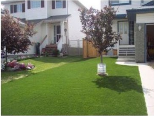
Incorrect – There should be a distinct boarder installed between the artificial turf and the neighboring natural sod.

Homeowners must provide a copy of the invoice, to verify the specifications have been met, as a visual inspection may not suffice.